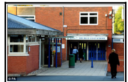
Bluecoat School Building

The priority is to maintain a well ordered and stimulating theatre environment with key vocabulary and photographs of student performance work from all Key Stages. We also place great importance on giving students responsibility for developing their skills in terms of all aspects of technical theatre, directing and devising, as well as performance.